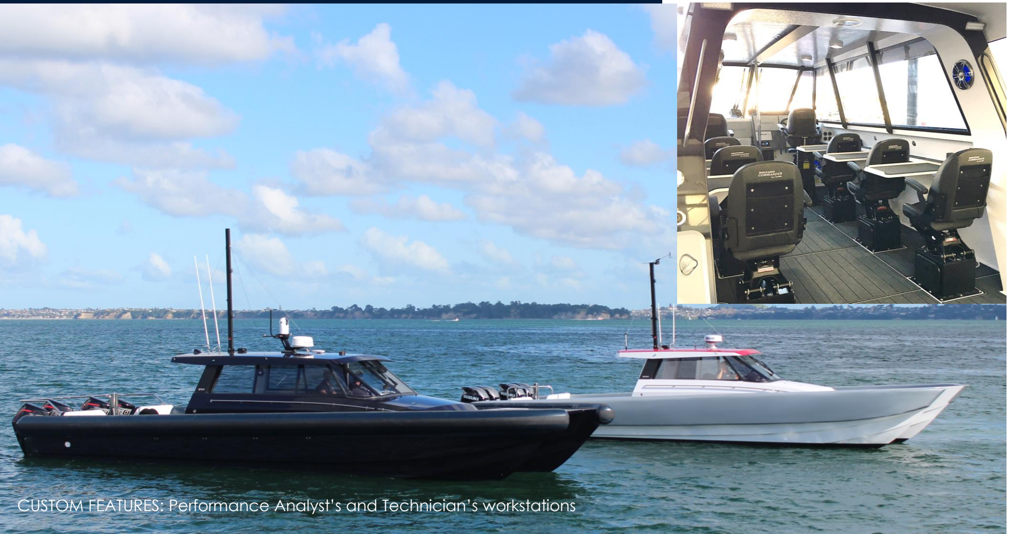
CUSTOM FEATURES: Performance Analyst's and Technician's workstations