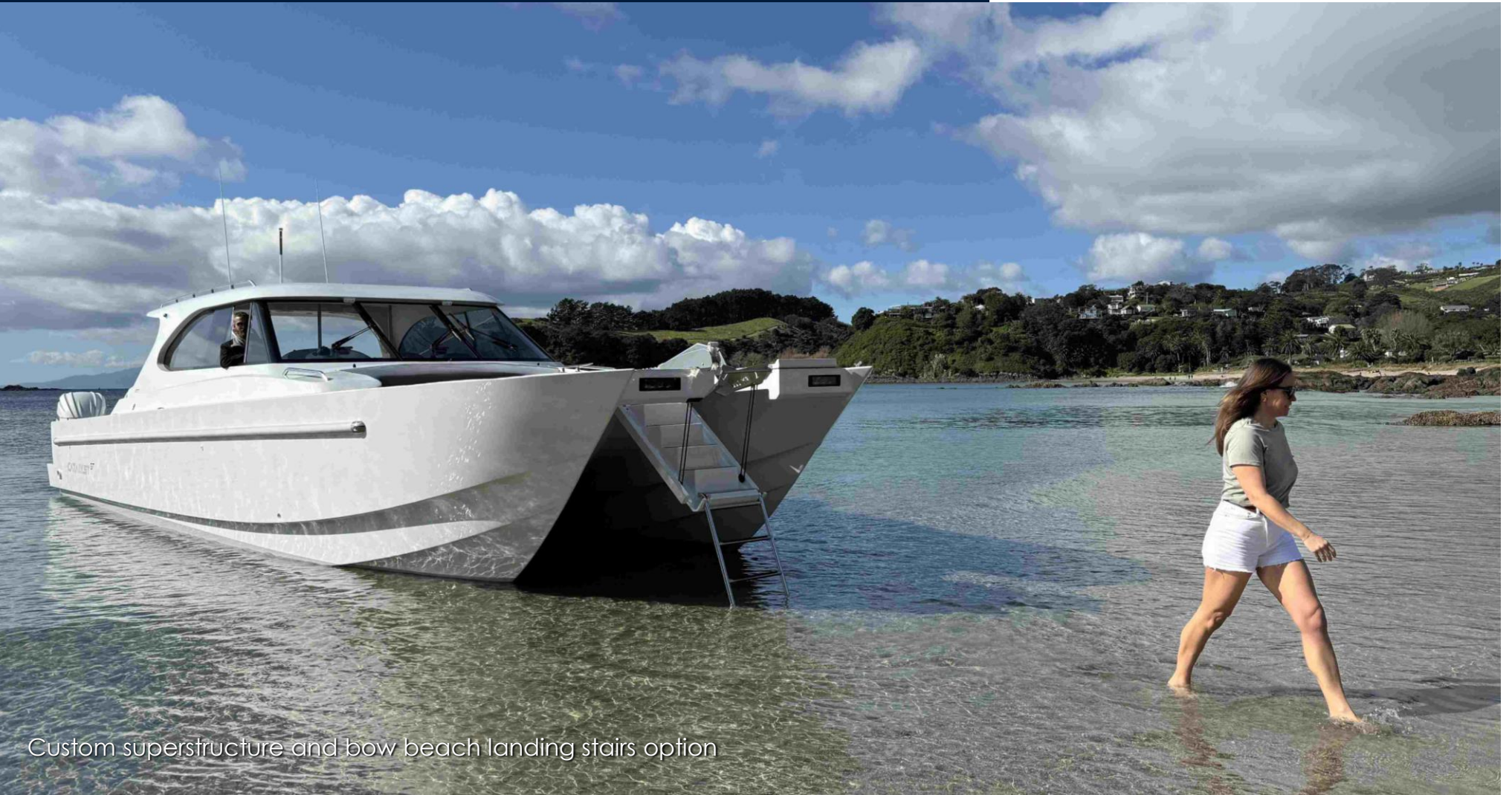
Custom superstructure and bow beach landing stairs option